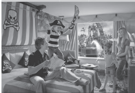
LEGOLAND ® Hotel

Discount tickets can be purchased at the Employees' Association JFB Room A17, x73146 or on the company intranet site.