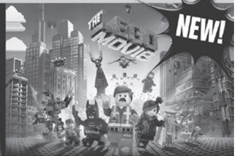
THE LEGO ® MOVIE EXPERIENCE