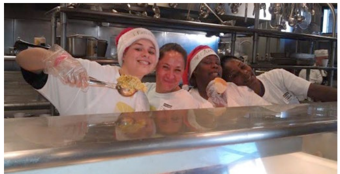
L.A. Mission- Taking a moment to ham it up for the camera while feeding the homeless downtown