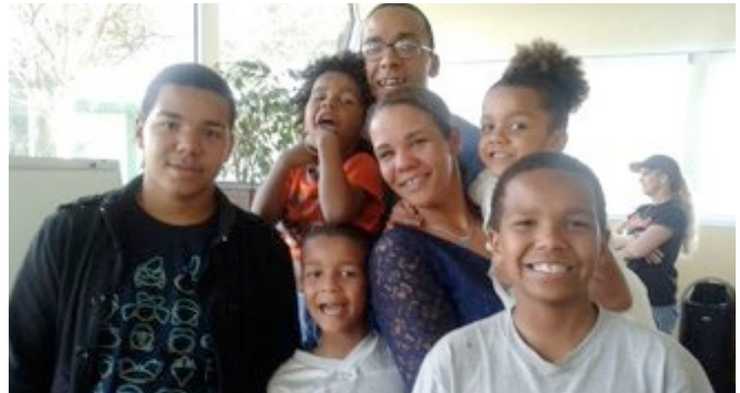
Oasis helps to reunite families through sobriety