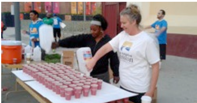
L.A. Marathon- Teaching women to be part of the positive spirit of Los Angeles