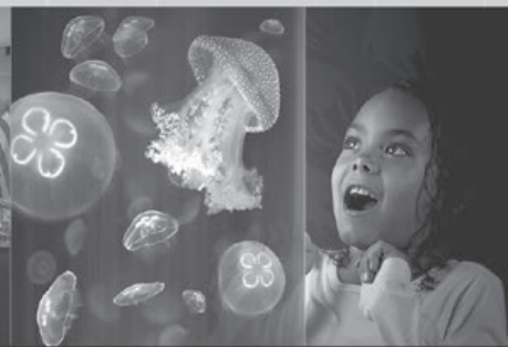
SEA LIFE ® Aquarium